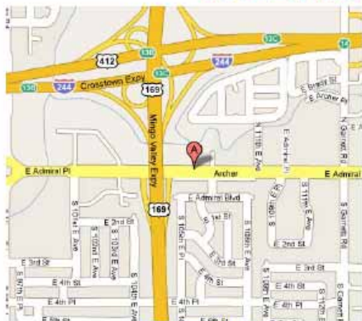
Brought to you by the T-Town Wheelers

Based in the Tulsa, Oklahoma area; our family orientated club enjoys collecting, racing, and customizing Hot Wheels™ die cast.